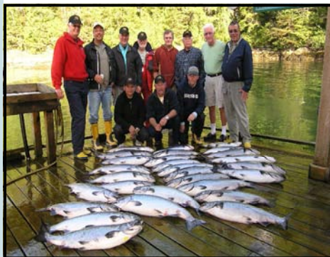
Benfield Canada Group celebrates after a great day on the water.