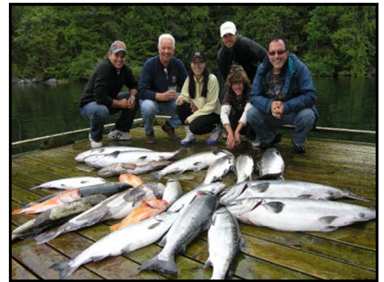
Butler Group and Friedman Group